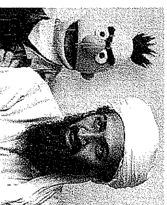
Fig. 1.1. Dino Ignacio's digital collage of Sesame Street 's Bert and Osama Bin Laden.

CNN reporters recorded the unlikely sight of a mob of angry protestors marching through the streets chanting anti-American slogans and waving signs